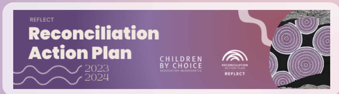
Children by Choice's RAP e-mail Signature